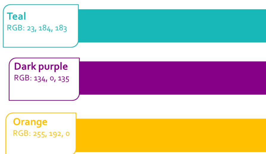
Figure 3. Colour Palette to be Used in Project Visuals

Word and PowerPoint templates for reports and presentations are prepared, and the logos, footnotes, theme colors (Figure 3), and font types (Open Sans) are set in these templates. These templates ensure that project outcomes and other relevant materials are consistent and comply with the Horizon 2020 visual guidelines.